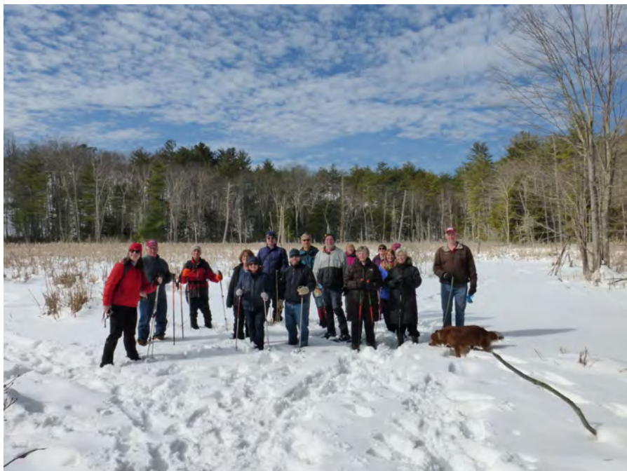
Arriving at the end of "Gene's View"