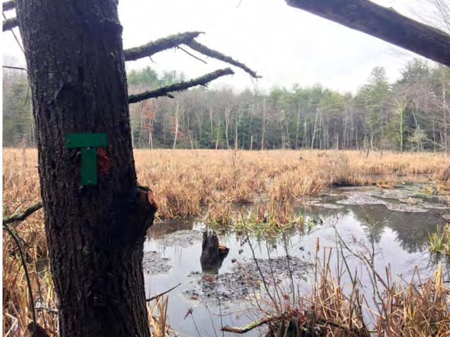
The wetlands at the end of the new trail