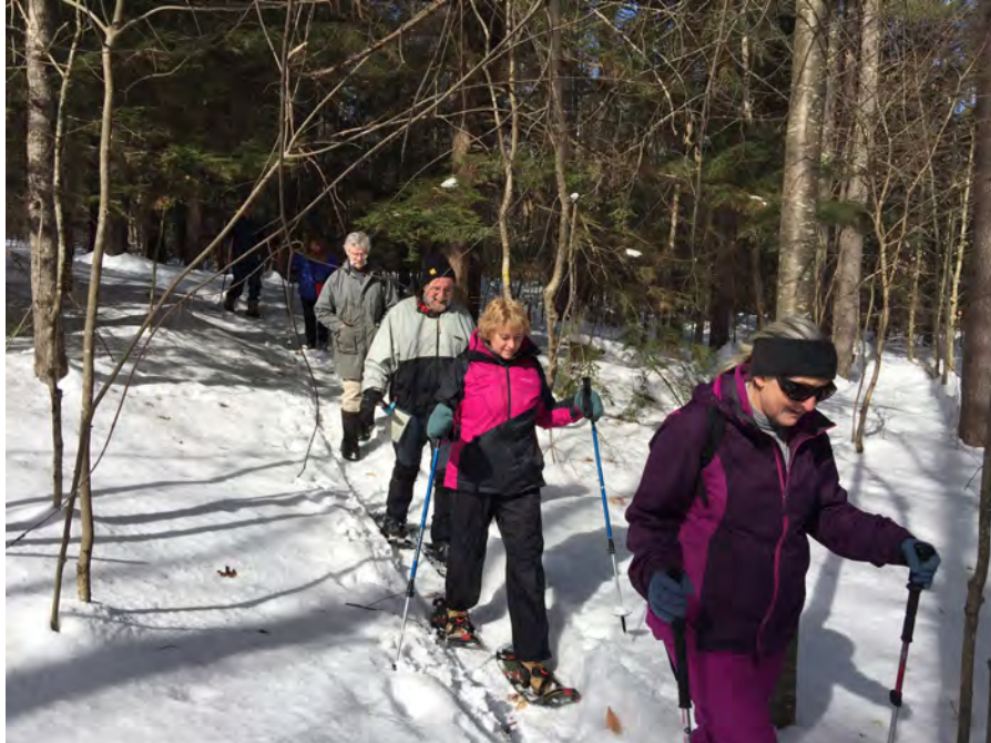
Members and guests of the Bedford Land Trust enjoyed a beautiful day hiking to the end of the new "Gene's View" trail on Saturday, February 18, 2017.