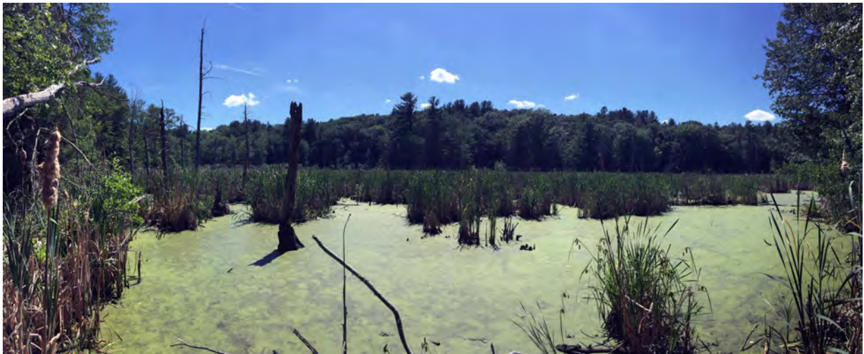
A summertime view near the end of the new trail