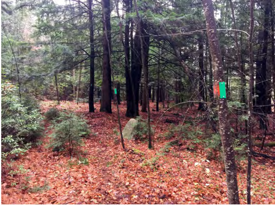
The beginning of the new trail, with green trail markers